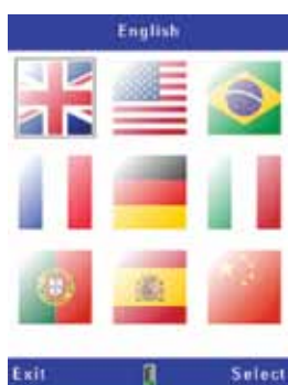
Multi-lingual user interface