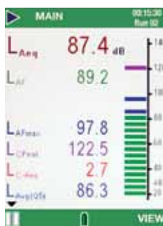
Broadband measurement screen

Measured parameters are displayed in different colours, and the bar graphs are illustrated with the same colours to give an easy understanding of the noise climate.