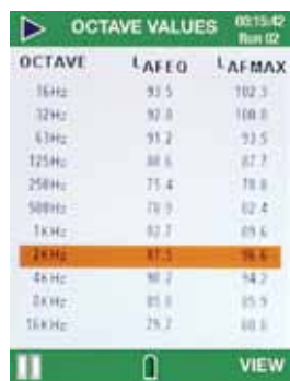
Tabular octave results